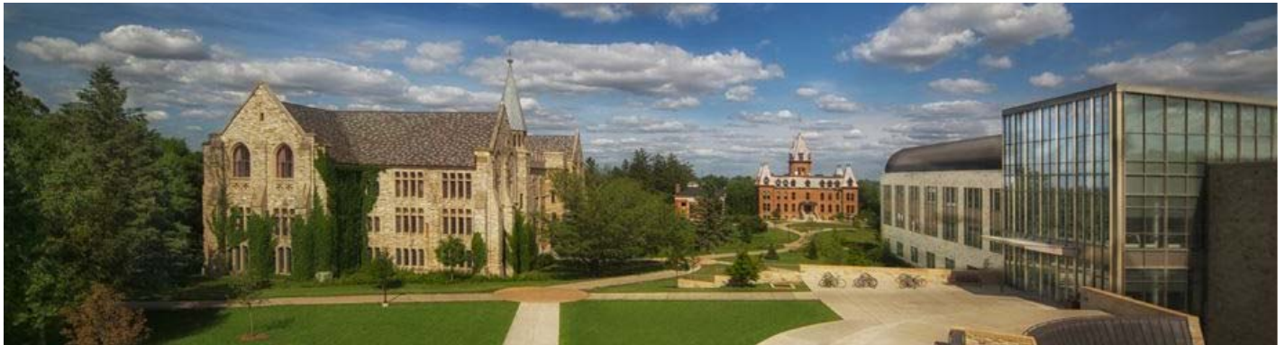
St. Olaf College campus