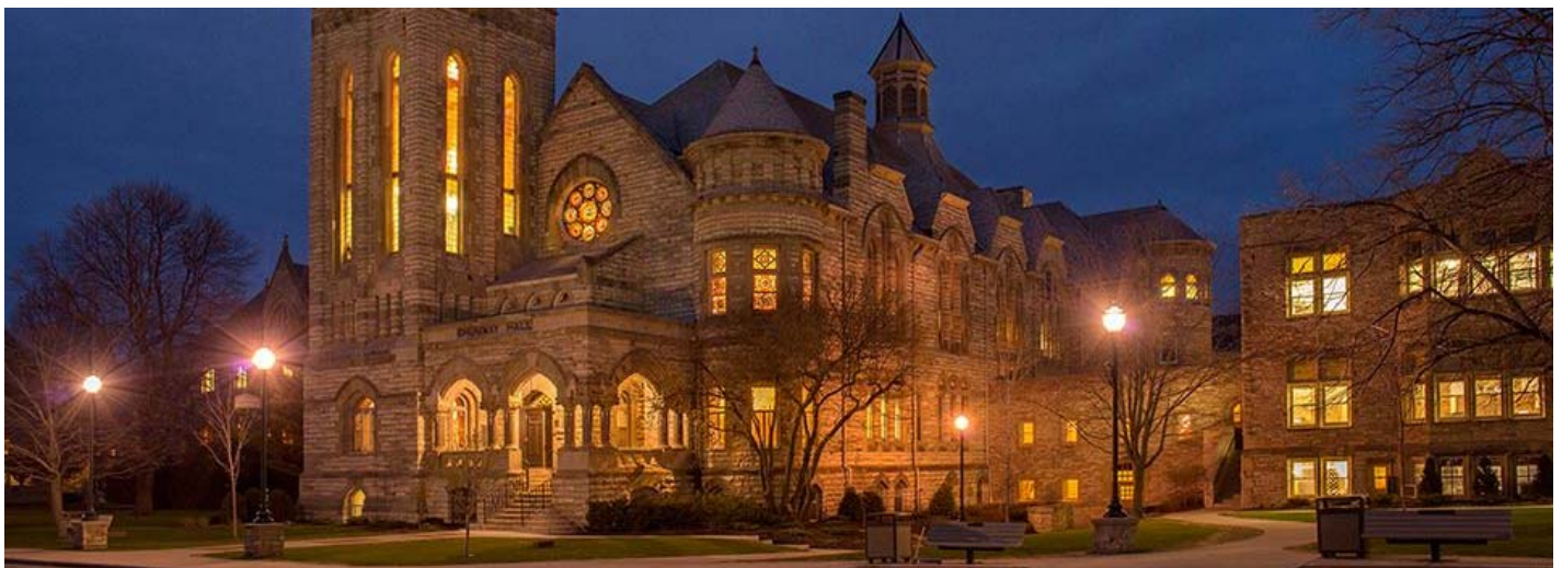
Shattuck-St. Mary's School campus