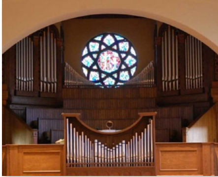
The Church of St. Helena